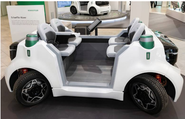
Caption: Schaeffler Mover is a concept for a small and highly versatile rolling chassis that is fully electric and can be combined with various body versions to support a range of different urban mobility and transport applications.